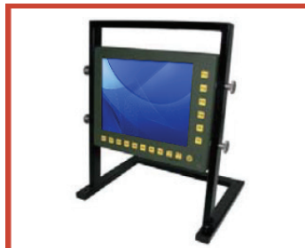
MOJAVE RD10 with StandUnit