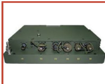
MOJAVE RD10 interfaces