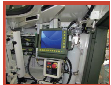
MOJAVE RD10 vehicle installation