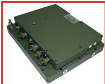
MOJAVE RD10 rear side